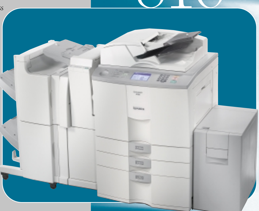
With our fastest print speed, the Sharp AR-810 IMAGER delivers the performance that busy offices and workgroups require.

Introducing the new Sharp AR-810 IMAGER Advanced Digital Document System. With more speed and unparalleled print processing power, this ultra-fast dynamo delivers amazing productivity to the workplace. With an amazing 81 ppm output, robust feature set, flexible finishing options, and new Sharp-developed software utilities, you can easily meet the requirements of today's business —and add the capabilities you need as your business evolves. And with Sharp's world-famous reliability and superior dealer service, you can depend on the AR-810 IMAGER to provide stellar performance—day after day.